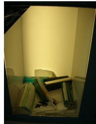
These are the tools for people who take Cannabis.

After attending the Jockey Club Drug Information Centre, I have learnt more about different types of drugs which are easily accessible in our daily life and also their side effects. In the first session of the visit, a speaker told us about the detailed information of each drug which is commonly found around Hong Kong, e.g. Ketamine, Cocaine and Ice etc. Various kinds of eating method of different drugs are also introduced.