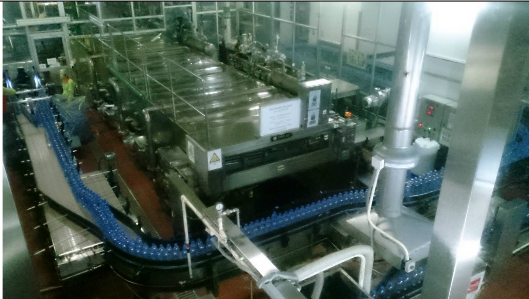
LAW KOK WING

The photo shows the production of plastic bottle water. The water bottles are first cleaned with high temperature, and then filled with limited volume of distilled water. Finally closed the bottle by the machine.