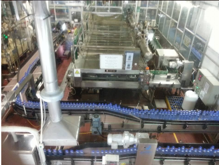
TANG WING CHUNG

Mechanization is used in the factory and workers check if there is unqualified products. It is clean, save and high efficiency.