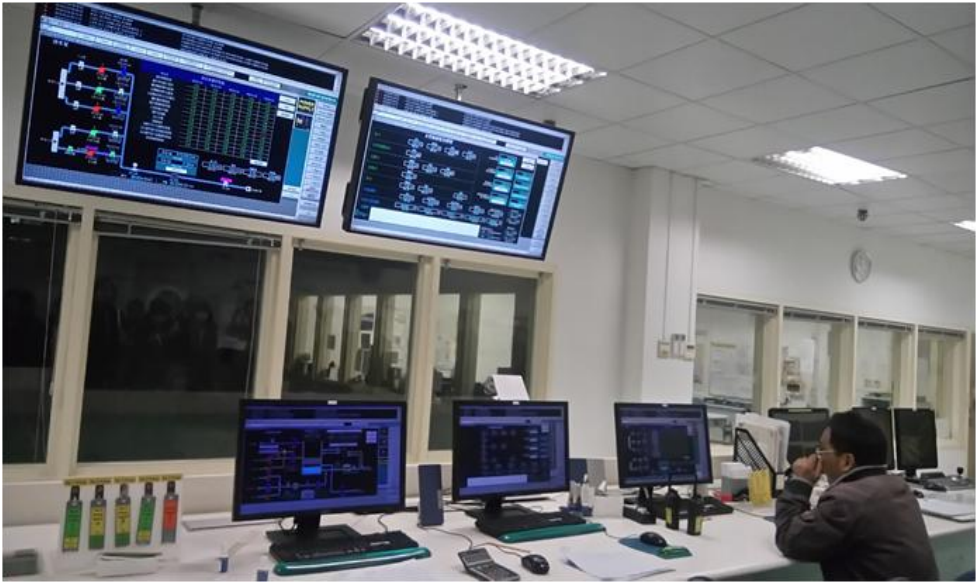
WONG SAU MAN

This picture shown that the main control room of the Ma On Shan Water Treatment Works.