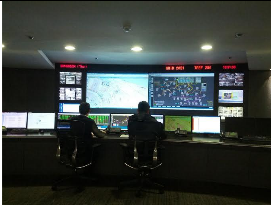
KWOK WING YAN

This is the control center of Towngas. The technicians can check the status of the gas delivery pipe via the system and make the necessary adjustments.