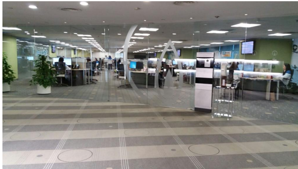
LEE TSZ YING

It is a centre for solving citizens' problems about town gas.