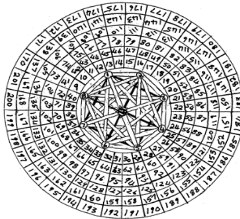
☞ Symbols of Alchemy